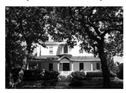
(110 Mercer Avenue)

Built around 1888, this home became a resident of Mercer Avenue sometime between 1895 and 1905 when it was moved from Sussex Avenue.