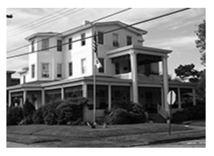
(Slide of 103 Mercer Avenue)

This lovely home was built in 1888 for Frederick Anspach, the civil engineer who designed the town plan for Spring Lake Beach. Sadly the home was recently razed and it is no longer part of Mercer Avenue. The footprint of the house and auto barn drawn on the 1905 Sanborn Map of the property matched the house and garage on the property today. Only the roof cap of the tower on the east side of the house has changed. The original hexagonal roof cap was removed sometime during its history.