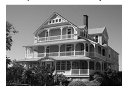
(100 Mercer Avenue)

This beautiful 5 level seaside cottage was built in 1882. There are 17 rooms on the 3 main floors. When the house was built, the cooking was done on the ground level and then sent upstairs, via a dumbwaiter, to the butler's pantry.